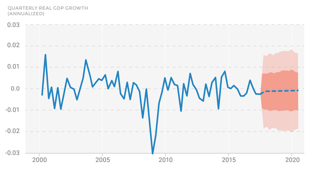
Exhibit 3 - Our Models Forecast a Continuation of Slow Economic Growth in the U.S.